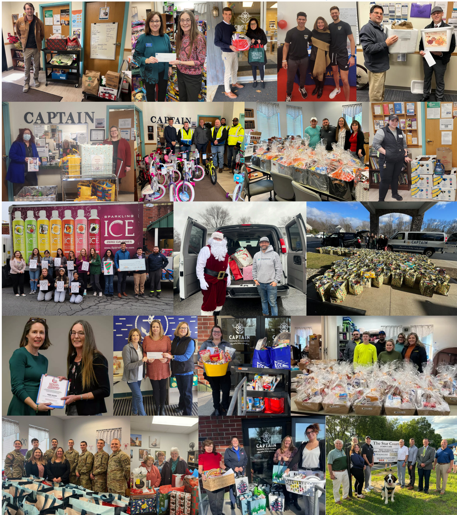
Top Row: Atlantic Testing Laboratories, Ballston Spa National Bank (BSNB), Herzog Law Firm, On the Move Health & Fitness, Greenlight Networks; Second Row: Pioneer Bank, County Waste, the Mill on Round Lake, Clifton Park Hannaford; Third Row: Toys for Toga (DeCrescente Distributing Company, Discover Saratoga, Druthers Brewing Company, Death Wish Coffee, Quick Response Restoration), Next Generation Roofing, Starpoint Church; Fourth Row: Times Union, Broadview Federal Credit Union, TCT Federal Credit Union, John W. Danforth Co.; Fifth Row: New York National Guard, Hope Church, Pepsi Co., Fenimore Asset Management and Siena College

In 2023, more than 1,700 individuals and businesses generously gave over $293,000 in goods and over $876,000 in monetary donations to support our neighbors in need!