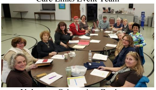
Volunteer Orientation Graduates