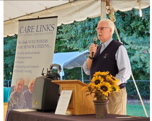
See more photos of our 25th Anniversary Celebration on our website at captaincares.org/care-links