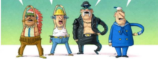
The Retirement Village People