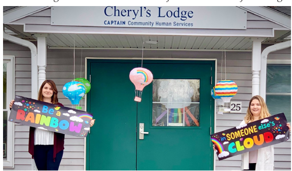
CAPTAIN CHS staff at Cheryl's Lodge, and all of our locations, participated in the #518RaimbowHunt to lift spirits.

their first apartment with the support they needed to succeed. Our phone lines were open for youth in crisis, and we connected virtually and through social media to meet their unique needs.