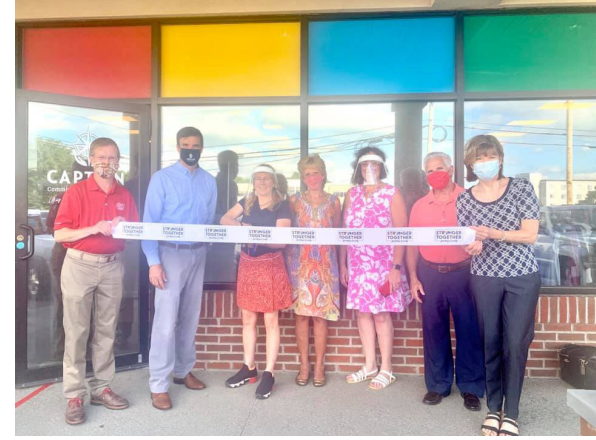
The Saratoga Chamber of Commerce and our staff were thrilled to cut the ribbon and reopen CAPTAIN's Treasures on July 20th.

The income generated by CAPTAIN's Treasures provides funding for our over 30 programs, filling in the gaps where government and private grants fail to meet the need. Yet, Treasures doesn't