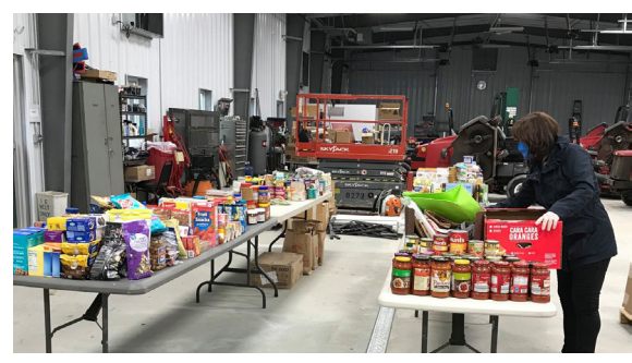
The Town of Clifton Park held multiple drive-up, drop-off food drives to support local families, bringing in more than 15,000 pounds of food and allowing CAPTAIN CHS the use of their warehouse for storage.

Because of you, homeless and at-risk youth had a warm bed at our Runaway and Homeless Youth Shelter. Several young adults who were victims of human trafficking or chronically homeless moved into