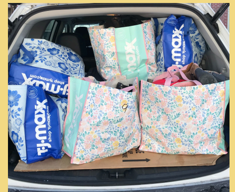
Car trunk completely full with shoes