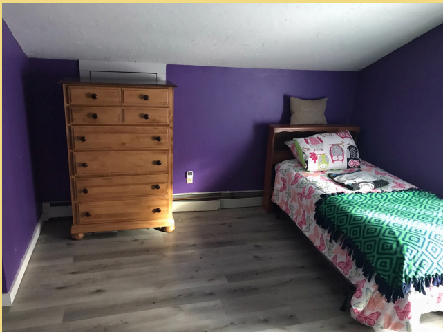
This is an example of a room we are looking to refresh at the shelter

If you or someone you know can donate painting supplies, furniture or even volunteer time, we'd love to hear from you! Every contribution helps make our shelter feel more like home.