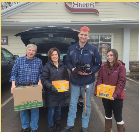
Picture above is the Organizer And Owner of Peace Together Project and our Street Outreach Team receiving a very generous donation.