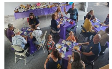
We do enjoy getting together around a good meal.