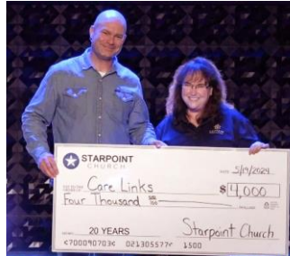
Starpoint Church makes a generous contribution to Care Links.