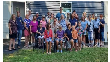
Getting everyone together for a team photo is not always easy.