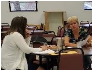
Discussing the needs of our seniors.