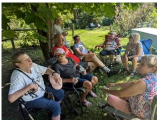
Getting some shade on a sunny day.