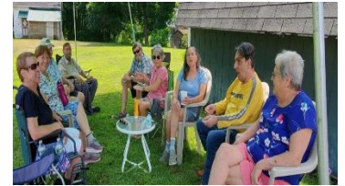
Annual picnic for the team