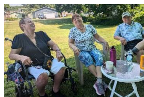
Laughter with a new friend is the BEST!