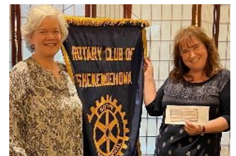
Shenendehowa Rotary Club presents Care Links with a generous contribution.