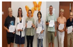
New Volunteers Graduate from orientation.